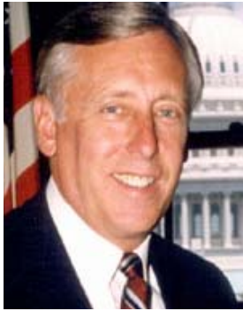
Steny Hoyer Congress 5