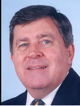
Roy Dyson State Senate 29